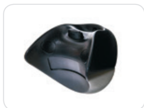
Pipette Holder for one mLINE® or Proline® Plus pipette