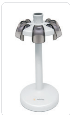
Carousel Stand (non-charging)

When the pipette is not in use, it should be stored in an upright position in order to avoid contamination from work surfaces. Sartorius provides stands for all of its pipettes. It is recommended that electronic pipettes be stored and charged on a charging stand whenever they are not in use. In this way, their batteries always remain charged for when work begins.