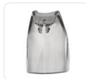
Adapter for Mechanical Carousel Stand