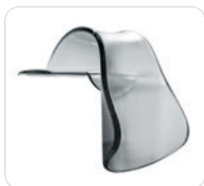
Pipette Holder for one Tacta® pipette

* Supplied with a universal charger (EU, UK, US | JPN, AUS, KOR and CHN plugs)