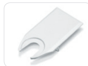
Pipette Holder for one Proline® pipette