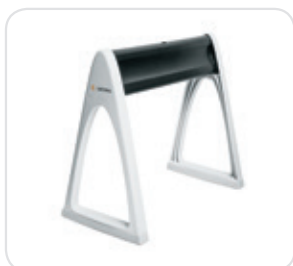
Linear Stand (non-charging)