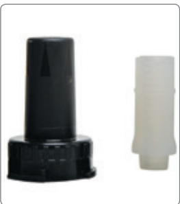
Standard nose-cone and silicone adapter set