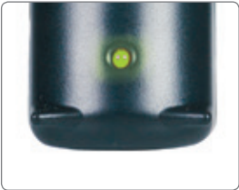
LED indicator starts to blink when the battery charge level is low