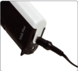
Pipetting is possible while connected to the AC-adaptor